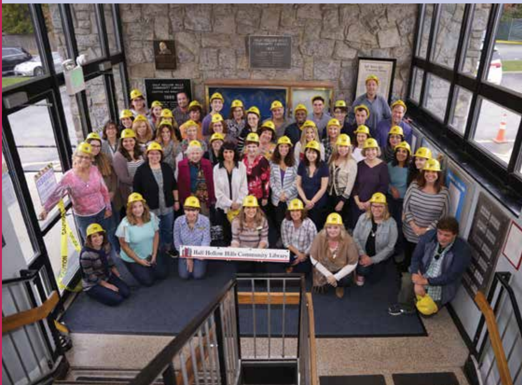
Staff on Moving Day, November 1, 2018.

A public information meeting will be held on Monday, March 25, 2019 at 7:30 PM at Chestnut Hill School.