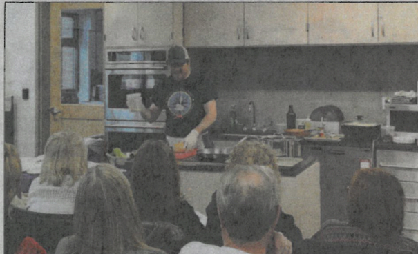
A Black Island Seafood Company representative conducted the first in-person cooking demo in the new library's teaching kitchen.

Please mention The Long Island Newspapers when doing business with our advertisers.